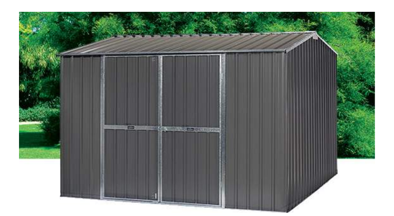
Double door as shown is not standard, see pg 13-14 for pricing