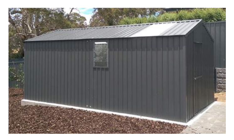
Skylight & window are not standard, see pg 13-14 for pricing